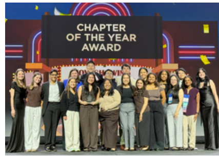
AMERICAN PHARMACISTS ASSOCIATION-ACADEMY OF STUDENT PHARMACISTS

UMSOP's chapter of the American Pharmacists Association-Academy of Student Pharmacists (APhA-ASP) received the Chapter of the Year Award at the APhA Annual Meeting in March in Los Angeles. In Patient Care Awards, the chapter was first runner-up for Operation Substance Use Disorder and second runner-up for Over-the-Counter Medication Safety.