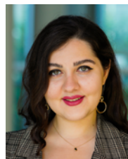
SEYEDEH TARANEH MOUSAVI